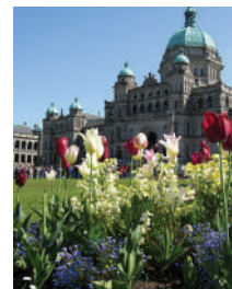
Vancouver, Victoria, Parksville, Coombs and Cathedral Grove