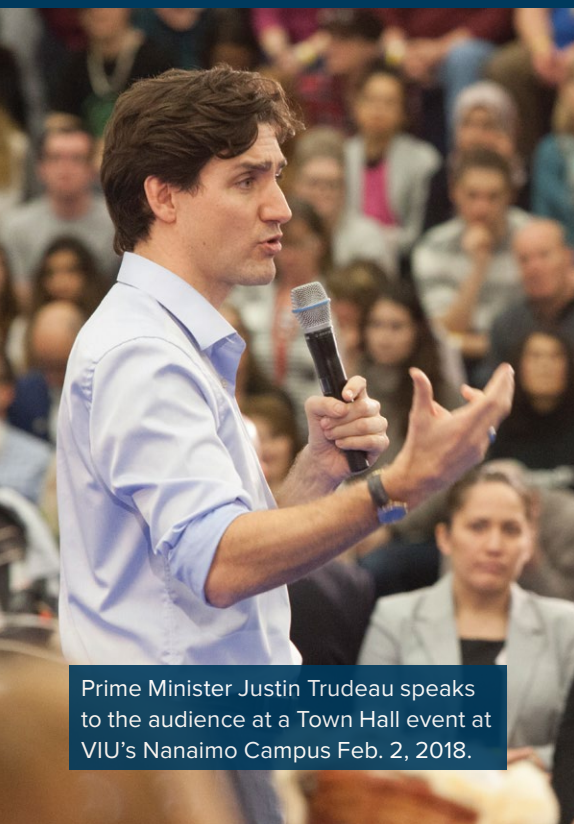
Prime Minister Justin Trudeau speaks to the audience at a Town Hall event at VIU's Nanaimo Campus Feb. 2, 2018.

We really do say “eh”! It’s even listed in the Oxford English Dictionary.