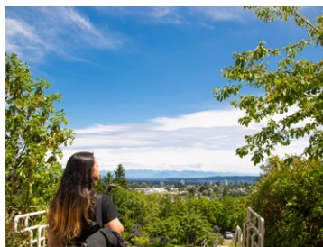
Mountain and ocean view from campus