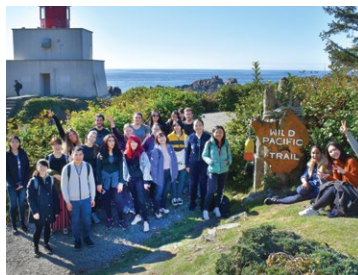
Hiking - Wild Pacific Trail - Ucluelet